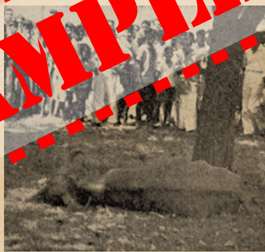
The buffalo is finally shot down near the New Town Hall.

He also estimated Rs. 40 million from the domestic market borrowing leaving an unbridgeable gap of Rs. 133 million. According to revised estimates Rs. 200 million will be from borrowing through local loans, Rs. 150 million from Treasury bills and Rs. 45 million from administrative borrowing and reduction of cash balances.