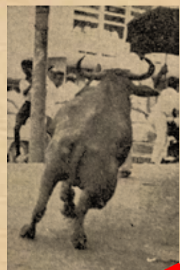
Balked by a motor car from killing him, the buffalo charges the crowd who are watching.