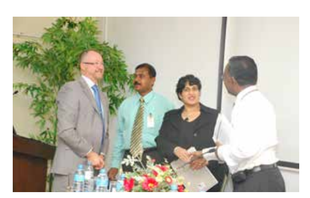
Awareness Program for Reporting Institutions sponsored by the AUSTRAC