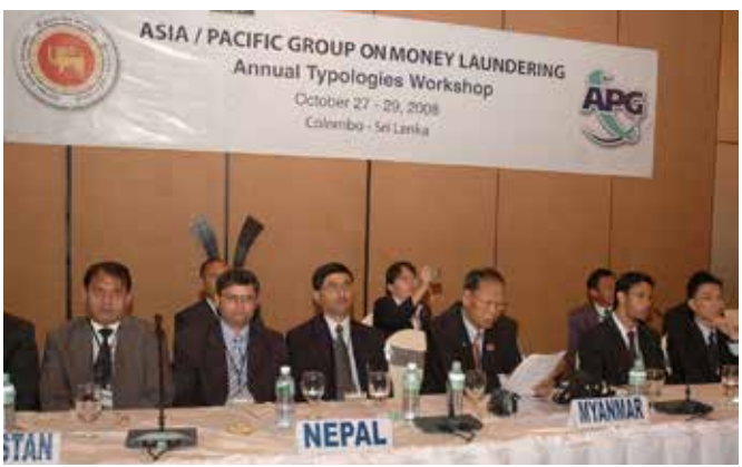
Hosted the APG Typologies Workshop, in Colombo, 27 – 29 October 2008

Pacific Group on Money Laundering"]. The FIU is in continuous dialog with the APG in relation to International Co-operation Review Group - (ICRG) review process and capacity building requirements of the FIU.