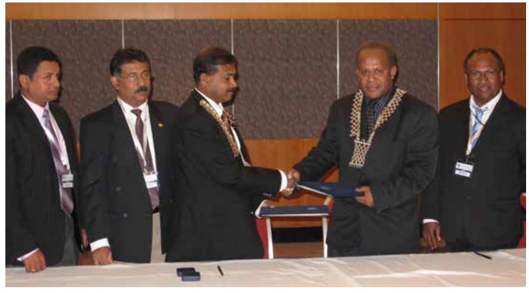
Signing MOU with FIU Solomon Island, during APG Plenary, Singapore