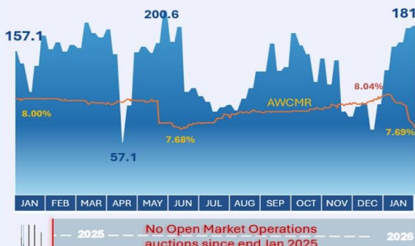
Central Bank Liquidity (Weekly average/ Rs. bn)