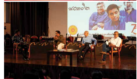
Cultural event “The Evening” at the Centre for Banking Studies

In addition, the Seva Vanitha Unit of the Central Bank donated two school libraries to schools in the Puttalam district on 8 November 2025 commemorating the 75 th Anniversary.