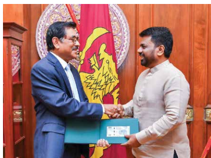
Governor presenting the first Rs. 2000 commemorative note to H.E. the President

In addition, a tabloid-sized newspaper supplement highlighting the history, milestones, and evolving role of the Central Bank was published in national newspapers.