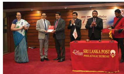
Special commemorative postage stamp issued by the Department of Posts