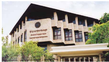
Figure – 17