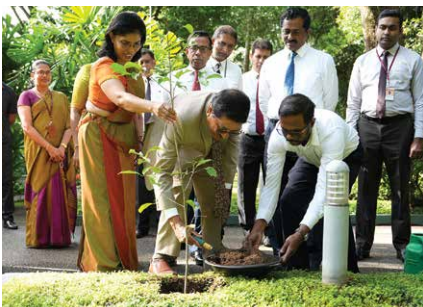
Tree-planting initiative “Mihikathata Adaren”

The “Mihikathata Adaren” tree-planting initiative was launched by Governor, Dr. Nandalal Weerasinghe, together with the Senior Deputy Governor, at Bank House, the Centre for Banking Studies, and the Central Bank’s Regional Offices.