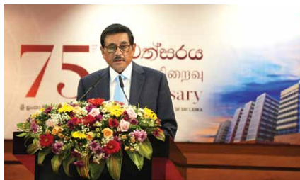
The Governor delivering the 75 th anniversary Oration

The event brought together distinguished policymakers, academics, and industry professionals to reflect on the evolution of the Bank and its role in shaping the country’s economic and financial landscape.