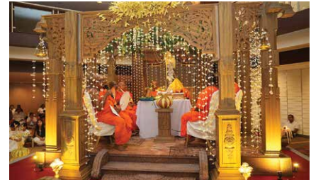
Pirith chanting ceremony

The Sinhala Cultural Association of the Central Bank organised a cultural event titled “The Evening” on 26 July 2025 at the Centre for Banking Studies. The Association also released “Abhimani,” a special anniversary song marking the Bank’s 75-year journey.