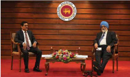
Public Seminar with Montek Singh Ahluwalia

A public seminar titled “Charting a Growth Strategy in a Changing Global Environment” was also held on 10 October 2025, featuring Montek Singh Ahluwalia as the keynote speaker.