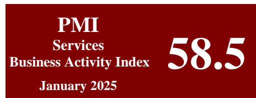
PMI - Services (Business Activity Index)

Expectations for Business Activities for the next three months continued to improve amid expected seasonal demand and favourable macroeconomic conditions.