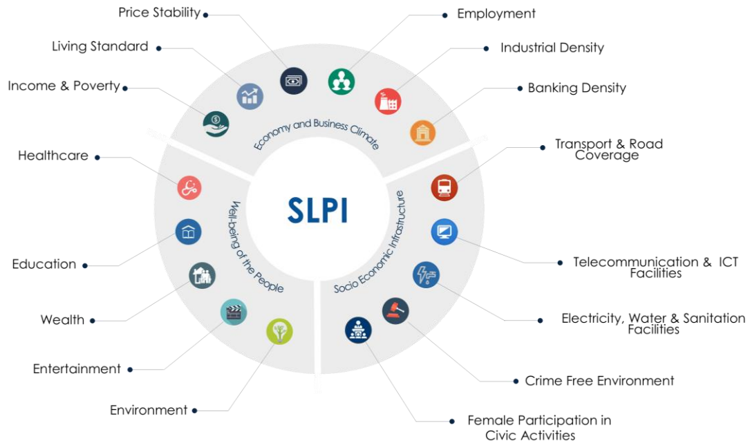
Figure 2 – Aspects covered in SLPI