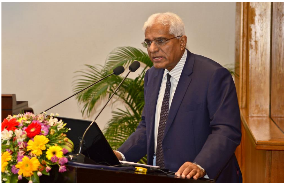
Dr. Indrajit Coomaraswamy, Governor of the Central Bank of Sri Lanka, delivering the inaugural address