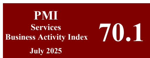
PMI - Services (Business Activity Index)

Employment : Number of staff working for the organization Stock of Purchases : Raw materials purchased and kept in a warehouse to be used for production Supplier Delivery Time : Time lag between order placement and delivery by the supplier Backlogs of Work : Uncompleted orders Other variables are self-explanatory.