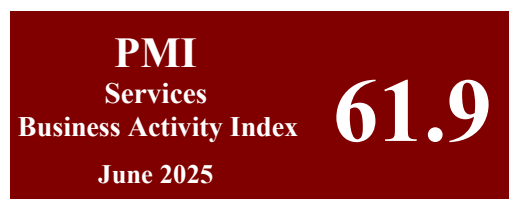
PMI - Services (Business Activity Index)

Expectations for Business Activities over the next three months continued to improve, supported by favourable macroeconomic conditions. However, some companies highlighted concerns over the implementation of taxes on the supply of services by a non-resident person through an electronic platform, and uncertainties related to US tariffs and developments in the Middle Eastern region.