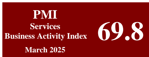
PMI - Services (Business Activity Index)

Employment : Number of staff working for the organization Stock of Purchases : Raw materials purchased and kept in a warehouse to be used for production Supplier Delivery Time : Time lag between order placement and delivery by the supplier Backlogs of Work : Uncompleted orders Other variables are self-explanatory.