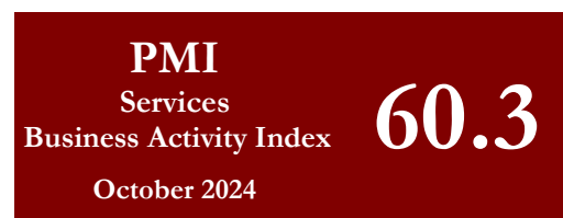
PMI - Services (Business Activity Index)

Meanwhile, Employment and Backlogs of Work continued to decline in October on month-on-month basis.