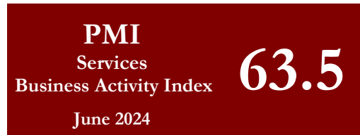
PMI - Services (Business Activity Index)

Expectations for Business Activities for the next three months continued to improve, at a higher rate, supported by favourable macroeconomic conditions.